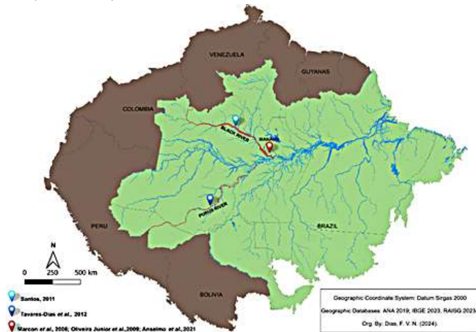
Figure 2. This literature review analyzed infographics of research sites (natural environment, production, and laboratory) of Amazonian Chelonians, according to each author.

In the differentiation of leukocytes, the relative and absolute counts of eosinophils in the studies analyzed (Table 2) showed similar numbers compared to those reported by Pires et al. (2008) ( 468.86 \pm 302.04 \mu\text{L} ; 15.55 \pm 6.52 \% ). Eosinophil values may increase in cases of parasitism and nonspecific immune stimulation, and the significance of eosinopenia in reptiles remains unknown (Silveira et al. , 2017).